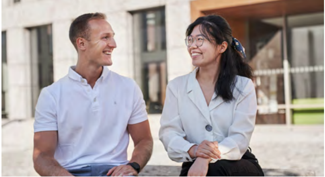
Collaboration in student groups

Processes of (de-)globalisation pose ever new challenges to large corporate groups as well as small and medium-sized enterprises. While in the past the focus was on issues of fierce international competition, opening up new sales markets and optimising global value chains, today it is also about the changing economic world order and its consequences for companies.