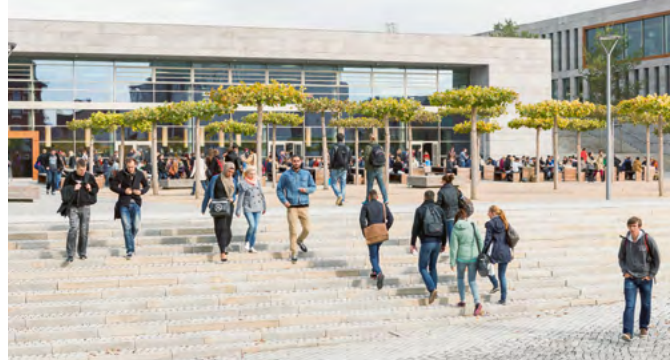
Central campus square

FACHWERK 5 05|2023