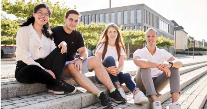
International student cohorts

Lay the foundations for your international career!