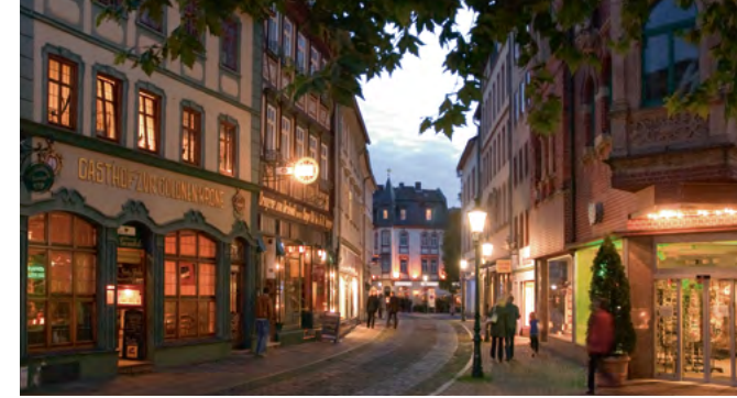
Fulda's bar and pub scene

International Office Fulda University of Applied Sciences